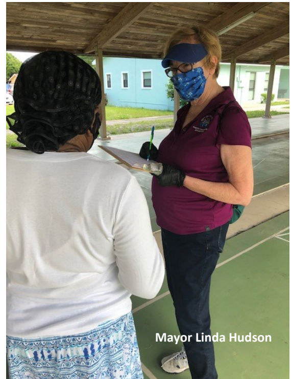
Mayor Linda Hudson

“We have been very impressed with GraceWay Village and its efforts to feed those who are struggling – especially our seniors and the disabled.”